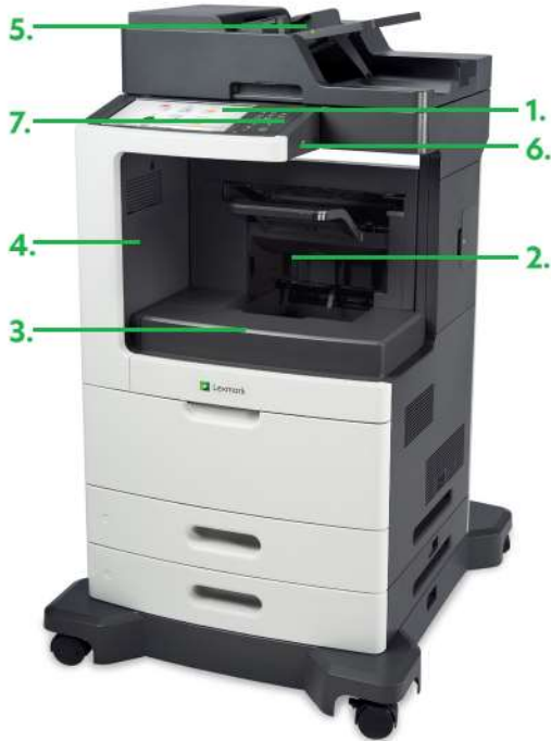
XM7263 model configured with Staple, Hole Punch Finisher