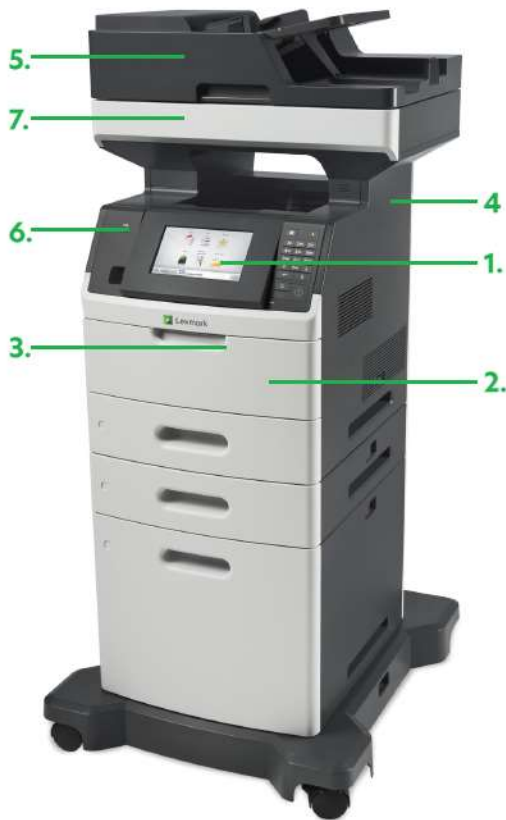
XM5163 model with 550-sheet tray, 2100 sheet tray and caster base